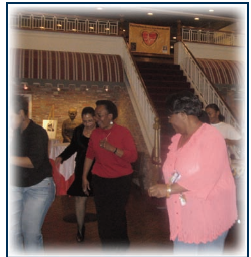
Constituents line dancing at candle-lit affair.

ical activity can aid in controlling and decreasing weight gain during cessation with significant emphasis on maintaining a healthy lifestyle. The overall goal is to increase knowledge and change the mindset of those consuming tobacco products and maintaining unhealthy lifestyles. Approximately 400 constituents statewide were reached on the harmful impact of tobacco products, secondhand smoke and ways to avoid roadblocks via healthy lifestyle changes.