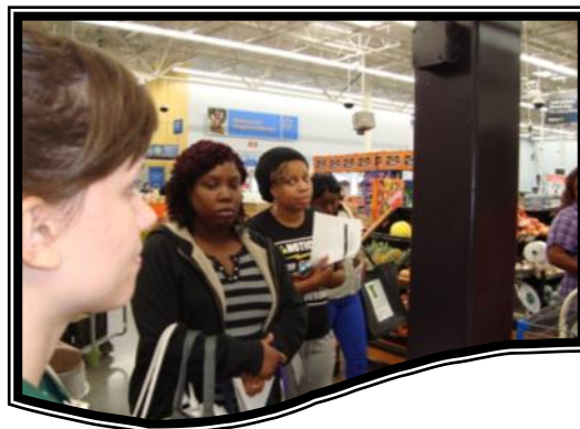
Head Start parents learn basic shopping skills at Wal-Mart, Donaldsonville

The areas in the store covered included fresh vegetable, spinach and lettuce, meat, bread, pasta, canned goods, cereal, juices and yogurt.