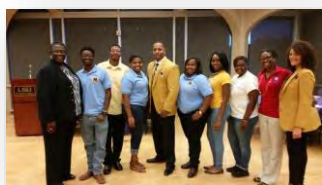
SU MANRRS Chapter at LSU

agricultural and natural resource sciences and related fields in all phases of career preparation and participation in these areas.