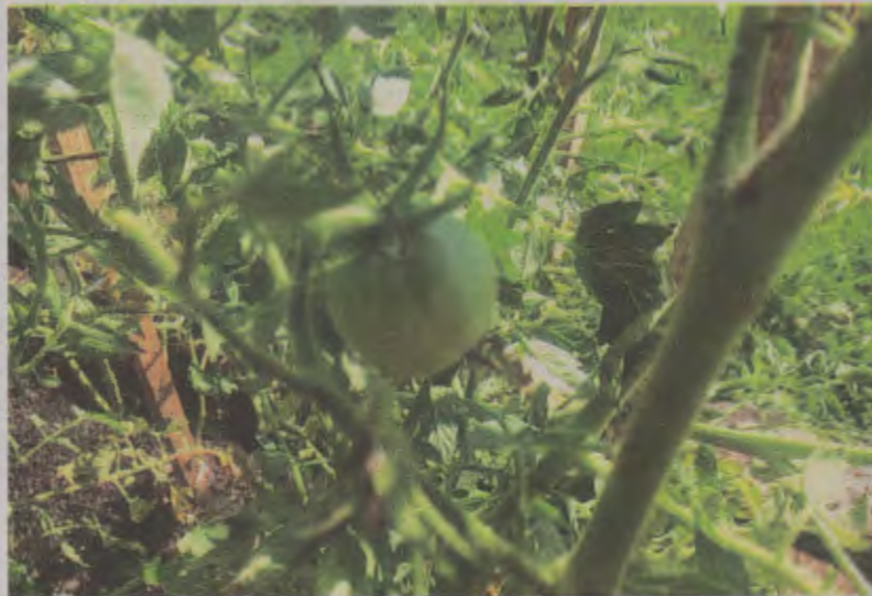
Tomatoes from Housing Authority of New Roads