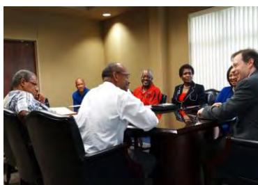
Team discusses solutions