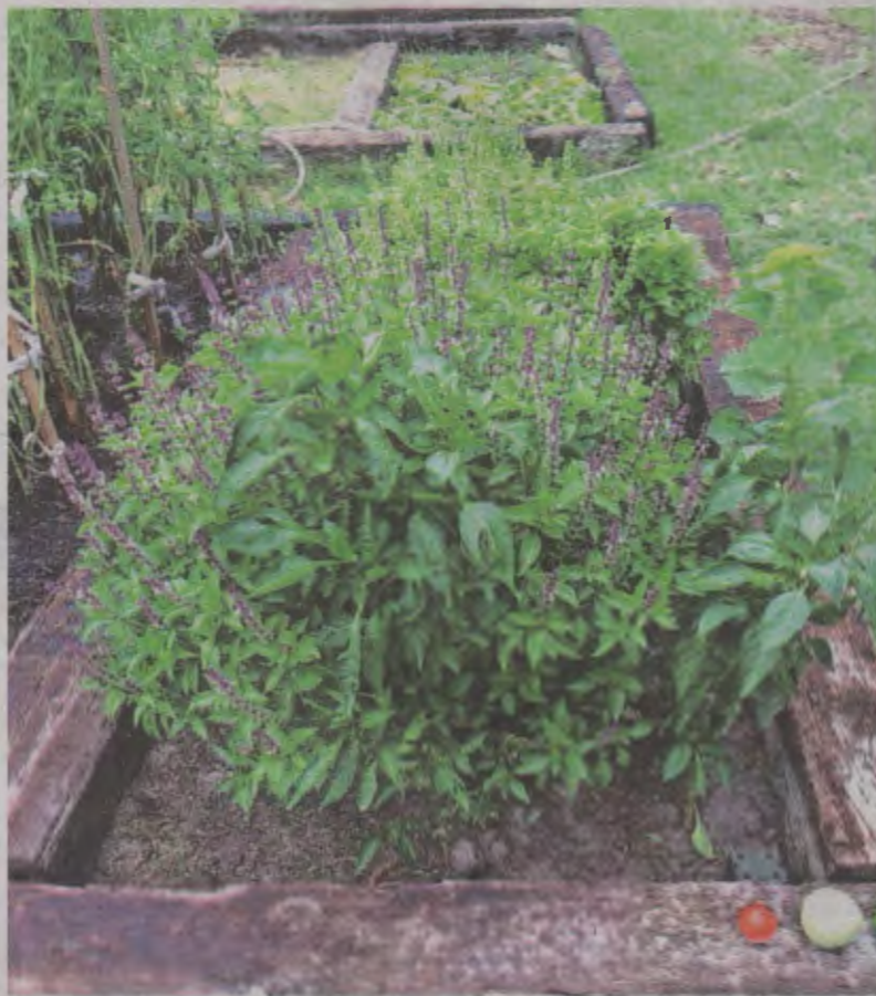
Housing Authority of New Roads Community Garden