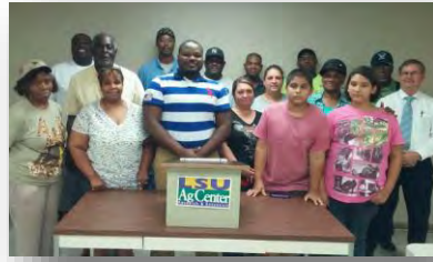
Informational meeting attendees

The aim is for the SU Ag Center to understand the science of production limiting diseases in small scale cattle operations and to acquire knowledge that will be used to improve the position of small