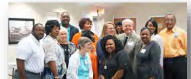
Strike Force Participants