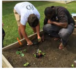
Students transplanting seedlings in garden

The fall garden project consists of tasty vegetables; collards: broccoli, Pak choi, cabbage, Swiss chard, butter crunch and Bibb lettuce, arugula, and cool season herbs. School gardens are the ultimate outdoor classroom! They provide authentic, real-world, inquiry based learning that is hands-on, educational, and fun. Students in the year-long culinary arts program do more than just use the produce in their classes. They also get their hands dirty, working in the garden in shifts. They weed, plant seeds, haul compost, and harvest produce.