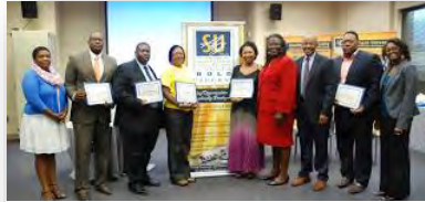
BOLD completers pose with Center admin, faculty, & staff

The Southern University Ag Center’s project entitled Building Opportunities through Leadership Development (BOLD) held its annual completion ceremony and reception on September 26 in A.O. Williams Hall.