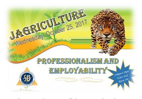
The Next Session will be on Wednesday, October 25, 2017, from 3:00 - 4:30 in Fisher Hall Room 106.

kindred spirits and our culture exemplifies pride, intelligence and most importantly Integrity.