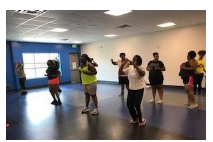
Students receive fitness training.

Participants who follow the guidelines have been losing body weight and their knowledge and awareness about healthy eating and physical activity have been increased. As future parents and caregivers, these students will be ambassadors for healthy communities and future generations.