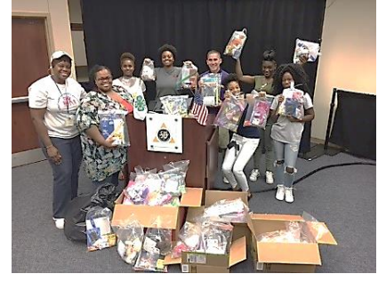
Figure Volunteers make care packages for Hurricane Harvey victims.

The care packages were to help young children to better deal with the stress they may have been experiencing. The care packages included educational materials, art and craft, stuffed animals, and snack.