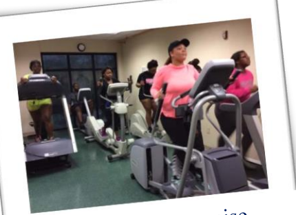
Students utilizing exercise room equipment