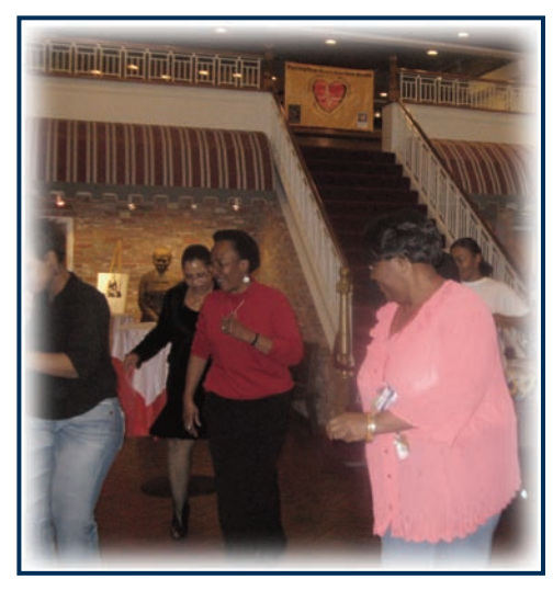
Constituents line dancing at candle-lit affair.

ical activity can aid in controlling and decreasing weight gain during cessation with significant emphasis on maintaining a healthy lifestyle. The overall goal is to increase knowledge and change the mindset of those consuming tobacco products and maintaining unhealthy lifestyles. Approximately 400 constituents statewide were reached on the harmful impact of tobacco products, second-hand smoke and ways to avoid roadblocks via healthy lifestyle changes.