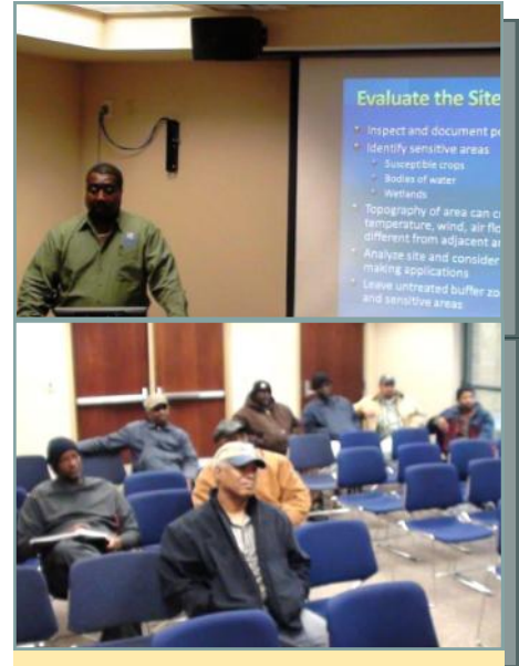
WPS Pesticide Handler Training

For more information, contact: Terrence Marshall at 225.389.3055