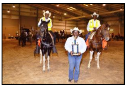
Bayou State Riders

In addition, our youth go out and teach other kids how to prepare their animals for the show. The club is open to all EBR youth even those without horses."