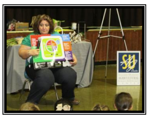
Coco explains the Choosemyplate guide

Additionally, Coco is working with the school on a spring garden, with plans to do another garden in the fall. "The students will plant vegetables such as cabbage, lettuce, carrots, radishes, cauliflower and broccoli, Coco said.