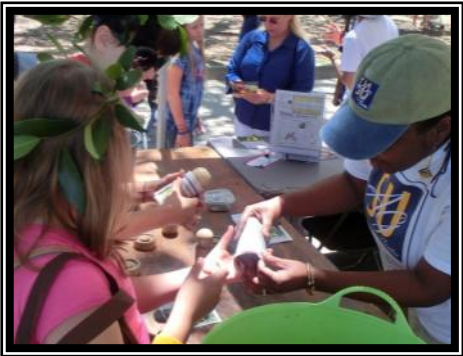
Down Town Baton Rouge celebration

For more information, visit Louisiana Earth Day at <u>http://</u> <u>www.laearthday.org</u>