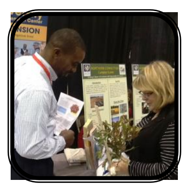
SU Ag Center employees disseminate information to participants of Ag Expo

For any questions or interest in programs on gardening and preserving foods, contact your local Agricultural Center Extension Office.