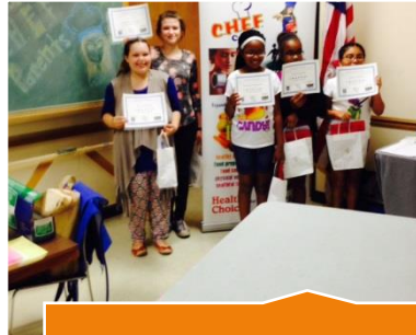
Campers pose with their certificates of completion