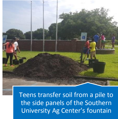
Teens transfer soil from a pile to the side panels of the Southern University Ag Center's fountain

For information about the Southern University Ag Center's horticultural programs and events, contact the Ag Center at 225-771-2242 or visit our website at www.suagcenter.com .