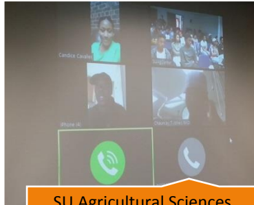
SU Agricultural Sciences alumni video chat with BAYOU participants

The full article is available at http://suagcenter.blogspot.com/2016/06/the-bayou-program-introduces-students.html