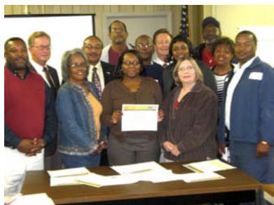
LEAD certificate award