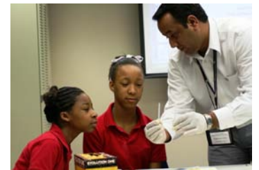
Hands-on demonstration on disease identification

More than 100 professionals, students, scientists and community members interested in the health and safety of plants attended the symposium.