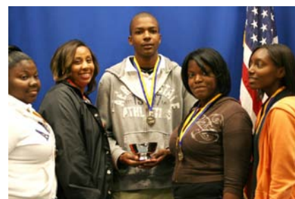
Clinton High—2 nd place winner