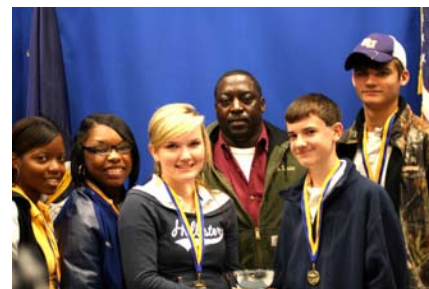
West Feliciana High—1 st place winner