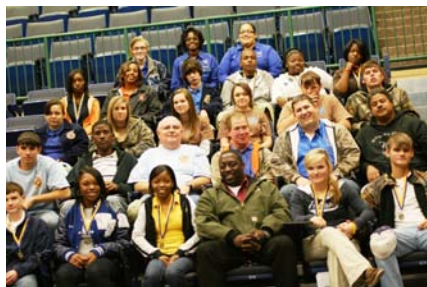
All five participating schools pose with teachers and SU Ag Center event coordinators