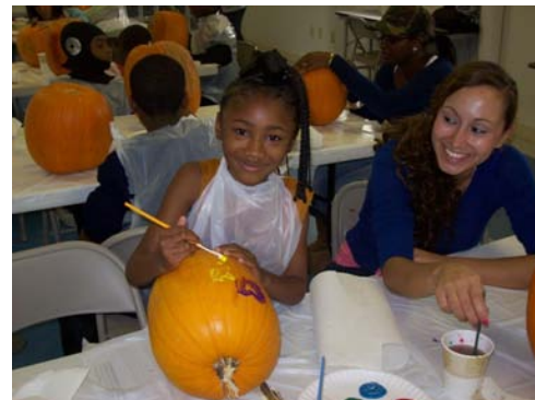
Participating students engaged in pumpkin artwork