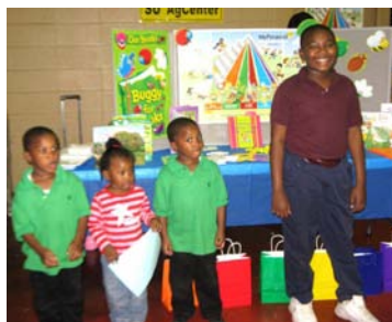
Kids on Family Literacy Night