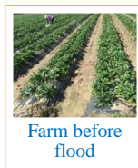
Farm before flood

Phytophthora spores are spread under flooded conditions, so chemical treatment will be needed to manage susceptible crops.