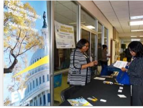
Conference participants interact with vendors