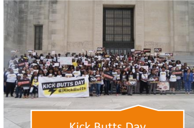
Kick Butts Day participants at the Capitol

tobacco use and assisted in other areas to make this a successful event. In addition to this, statewide, CoC coordinators conducted individual KBD activities within their parish jurisdictions at churches, schools, and civic organizations.