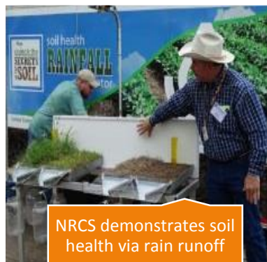
NRCS demonstrates soil health via rain runoff