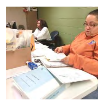
Behind the scenes