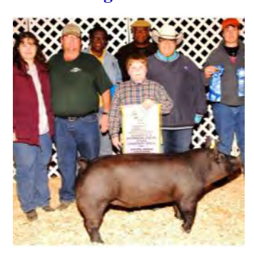
Champion market hog