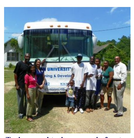
Trainers and trainees pose in front of the SU Ag Center Mobile Unit

Southern University Baton Rouge campus to assist in meeting the needs of this rural community in the future.