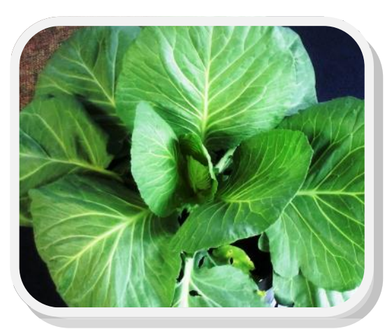
A sample of cabbage plant from Tallulah Elem School Garden