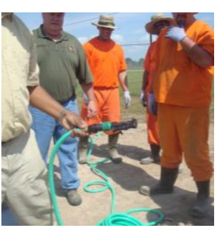
The garden team prepares to water plants

and the press were on hand. The event received wide media coverage including the Daily World, the Alexandra Town Talk, the Baton Rouge Advocate and the KNOE 8 News in Opelousas. The article is available online at: <a href="http://www.dailycomet.com/">http://www.dailycomet.com/</a>