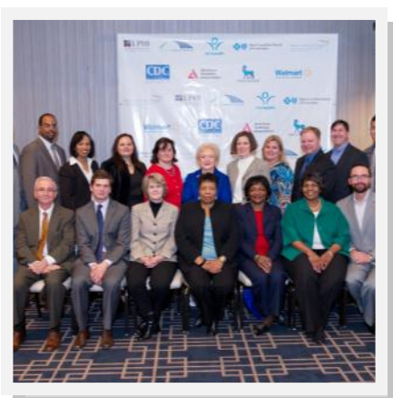
Front row, Brown in green

To enroll in the program, text "HEALTH" to 300400 on mobile phone or online at <a href="https://txt4health.com/txt4health/Display/display.aspx?CurrentXsltId=5">https://txt4health.com/txt4health/Display/display.aspx?CurrentXsltId=5</a>