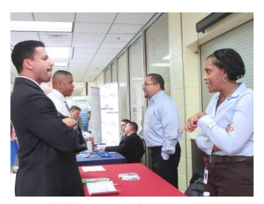
Exhibitors and conference attendees interact

The Louisiana State Contractor Licensing Department was also available to answer questions from individuals interested in becoming licensed as well as existing contractors who wish to expand their businesses.