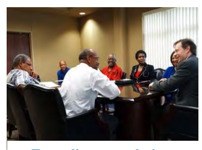
Team discusses solutions

from SU, interested in veterinary medicine, have a higher chance of enrolling at Tuskegee University than LSU, with additional burden of out of state fees. This initial meeting was to explore the causes of barriers to Southern students entering the LSU