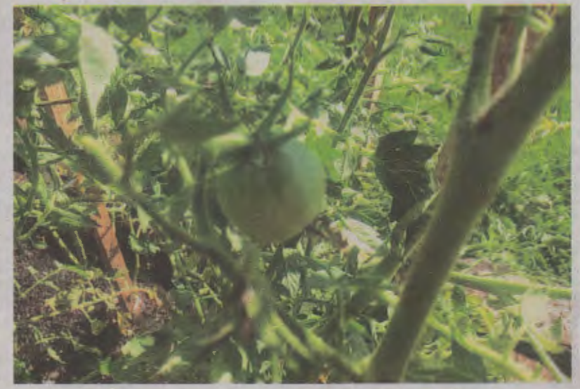
Tomatoes from Housing Authority of New Roads