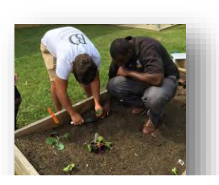
Students transplanting seedlings in garden

The fall garden project consists of tasty vegetables; collards: broccoli, Pak choi, cabbage, Swiss chard, butter crunch and Bibb lettuce, arugula, and cool season herbs. School gardens are the ultimate outdoor classroom! They provide authentic, realworld, inquiry based learning that is hands-on, educational, and fun. Students in the year-long culinary arts program do more than just use the produce in their classes. They also get their hands dirty, working in the garden in shifts. They weed, plant seeds, haul compost, and harvest produce.