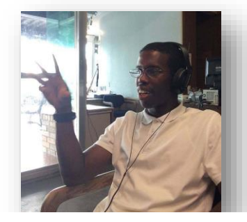
Ross on the air

per month, DeLane speaks Live on the AM station K.A.N.E in New Iberia, LA. Each month a different topic is presented ranging from best crop varieties for Southern Louisiana, to adjusting gardens to accommodate seasonal changes. During